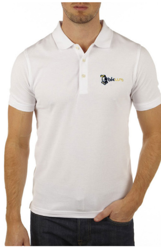
Sport Men's Performance Three-Button Polo