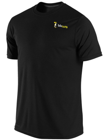
Sport Men's Dri-Blend Short-Sleeve T-Shirt (Black)