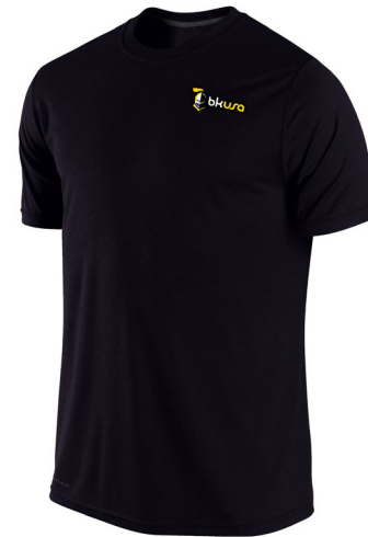
Sport Men's Dri-Blend Short-Sleeve T-Shirt (Navy Blue)