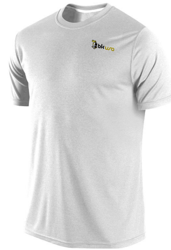
Sport Men's Dri-Blend Short-Sleeve T-Shirt (White)