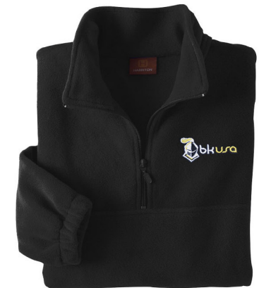
Black Knight Fleece (Black)

Full range of sizes and colors available